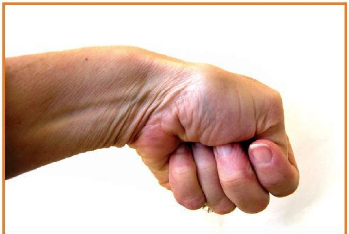
Figure 1A: The first dorsal compartment. There are six compartments on the dorsal, or back, side of the wrist. The first and third compartments house tendons that control the thumb.